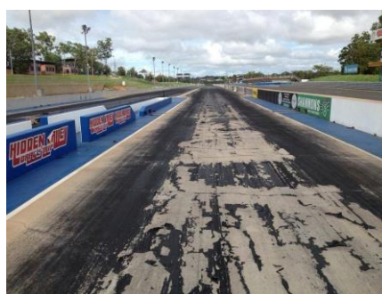
This is what the strip looks like after a wet season in Darwin. Plenty of work to be done throughout February and March to get it up to scratch. If you can lend a hand drop us a line.

A simple fact sheet on how the vouchers may be redeemed is available online